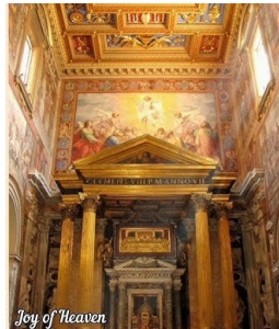
Joy of Heaven

It also challenges us to recognise our personal baptismal identity as temples of the Holy Spirit, and to confirm that identity by the way we live.